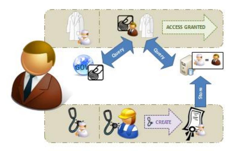
Figure 1. Instances of digital shadowing for a doctor. The doctor's white coat and electronic stethoscope store his virtual identity and act on his behalf. (Top) The coat and the doctor's fingerprints are elements of an authentication method. (Bottom) As the doctor uses the stethoscope, it not only records and stores the patient's heartbeats, but also signs the data on the doctor's behalf and stores it in the hospital database.

The coat and fingerprint authentication scenario in Figure 1 might also benefit from revocable access delegation, [8] in which an RFID tag (the logical node) returns a valid ID (the virtual identity) only if the tag's owner has authorized the reader. These tags are essentially part of the user's digital shadow because they provide no user information (only a number), but any reader with explicit user authorization will know that they belong to that user. Because the tags' ID is not easy to link to its owner and the user can revoke authorization at any time, the digital shadow approach also accounts for privacy.